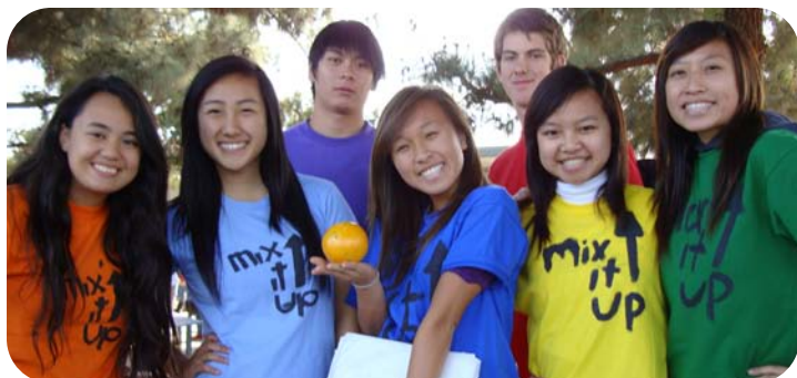
Mix-it-Up Lunch at La Quinta High School

12 week training to enhance goal setting and decision making skills.