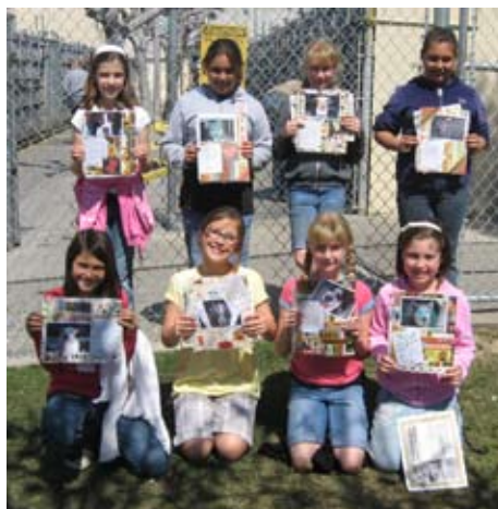
This Girl Scout troop shows off their handmade signs for the shelter dogs