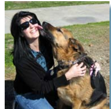
Kisses from Jonsee!

We opened our home and hearts to another dog from your shelter just about a month ago, another German shepherd. He is wonderful, shy, sweet and full of love. It took him a week or so to warm up to us, but now he greets us at the door, tail wagging and so excited to see us! We named him Fritz which means "Peaceful Ruler" in German, very fitting for the sweet little guy. These are wonderful animals that needed a loving home and I'm so happy I've been able to provide that for them. It's through no fault of their own that they found