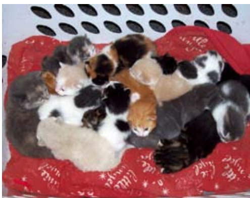
This group of 17 kittens arrived at the shelter in a laundry basket and within a matter of hours all of them were transferred to adoption partners

P ounce, purr, and play...the life of a kitten in a foster home is always a blast. Each year OC Animal Care receives hundreds of kittens in need of immediate care. Once the weather begins to warm up, kittens pour into the shelter by the