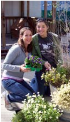
Big smiles as flowers are planted around the shelter

On Saturday, March 15th, 54 eager youth made their way to the shelter to participate in OC Animal Care's first-ever Community Service Day. With a waiting list of over 100 participants, the event was very popular with individuals, youth groups, and schools throughout the county.