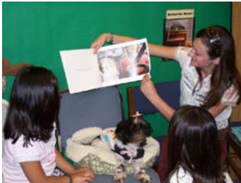
Minnie the Dog is all ears for this tale of a shelter dog's happy ending!

The moment four paws and a wagging tail enter the library, smiles spread across kids' faces. Each summer OC Animal Care hosts the "Reading with Fido" program at Orange County Libraries. "Reading with Fido" was designed to give children the op-