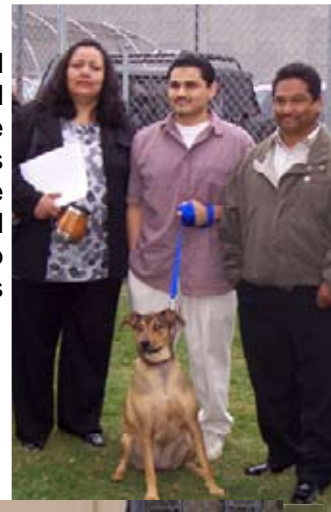
Trixie and Bosco with their new families

The event was a huge success. The dogs have all settled into their new homes and are continuing with their training. Six new dogs have been selected for the program and began their training on March 14th. They will be ready for adoption around June. For more information about the Prison Pups, visit us online at ocpet-info.com .