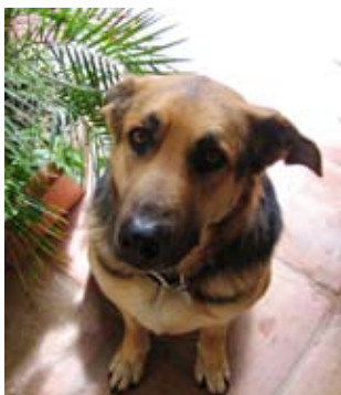
Fritz the "Peaceful Ruler"

Several years ago my husband and I found a beautiful six year old German shepherd in your shelter and fell in love with him. When we visited with him, all it took was a kiss on the hand and a paw on my knee to seal the deal! He was well behaved from the start and bursting with love. He was a wonderful dog that will forever have a place in my heart. Unfortunately he developed bone cancer, as is common in dogs of his size and breed. It broke my heart to lose him and I miss him immensely, but when one door closes another door opens.