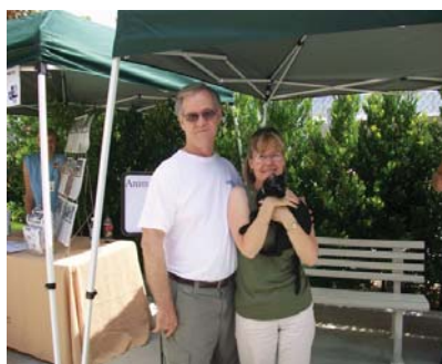
This happy couple adopted their forever friend at Catopia!

OC Animal Care sent the Purrfect love home as 49 cats and kittens were adopted during Catopia. On August 29th, OC Animal Care hosted our second annual event to promote shelter cats. New adopters received a free spay or neuter for their new feline friend, a free carrier, and pet care supplies. Children attending the event made glitter greeting cards to welcome their new cat to the family. A bake sale benefitting shelter animals was also a huge success. OC Animal Care staff and volunteers celebrated as the dreams of 49 cats and kittens came true in finding the forever homes they had been dreaming about!