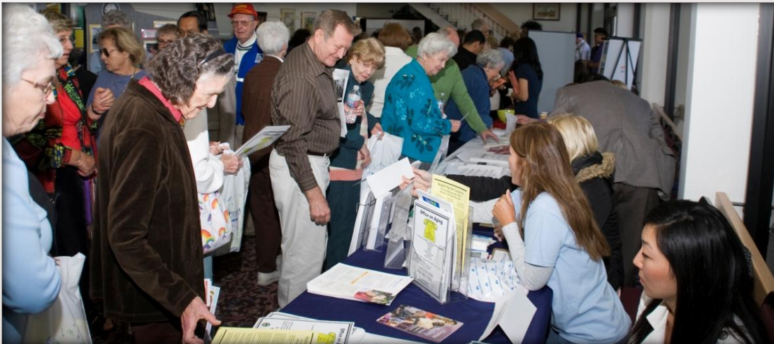
Local residents get health information from community organizations.